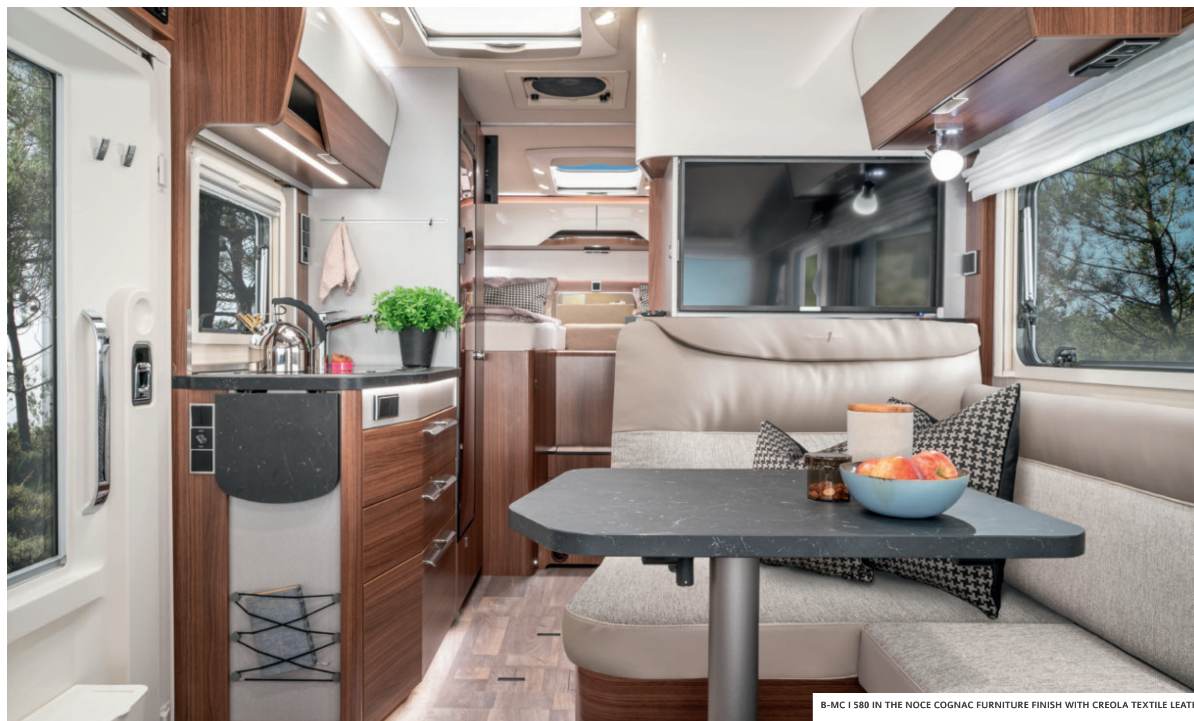
B-MC I 580 IN THE NOCE COGNAC FURNITURE FINISH WITH CREOLA TEXTILE LEATHER