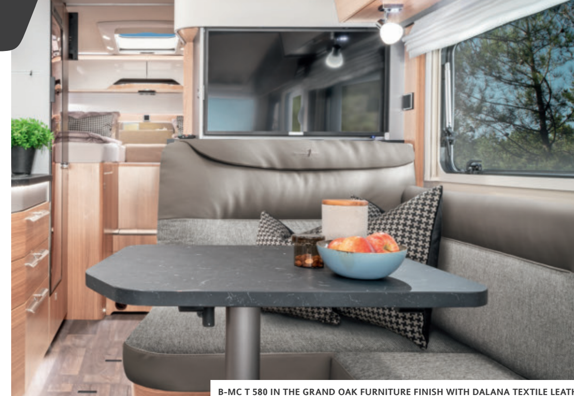
B-MC T 580 IN THE GRAND OAK FURNITURE FINISH WITH DALANA TEXTILE LEATHER