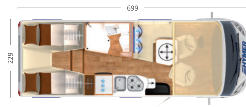
B-MC I 580

Overall length approx. 699 cm Overall width approx. 229 cm Overall height approx. 296 cm Single bed size 194 x 86 cm Seats 4 Berths 4